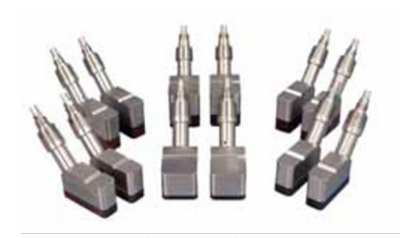
Panametrics technologically advanced clamp-on gas ultrasonic transducers

The new line of clamp-on gas transducers produces signals that are five to ten times more powerful than those of traditional ultrasonic transducers. The new transducers produce clean, coded signals with very minimal background noise. The result is that the DigitalFlow GC868 flowmeter system performs well even with low-density gas applications.